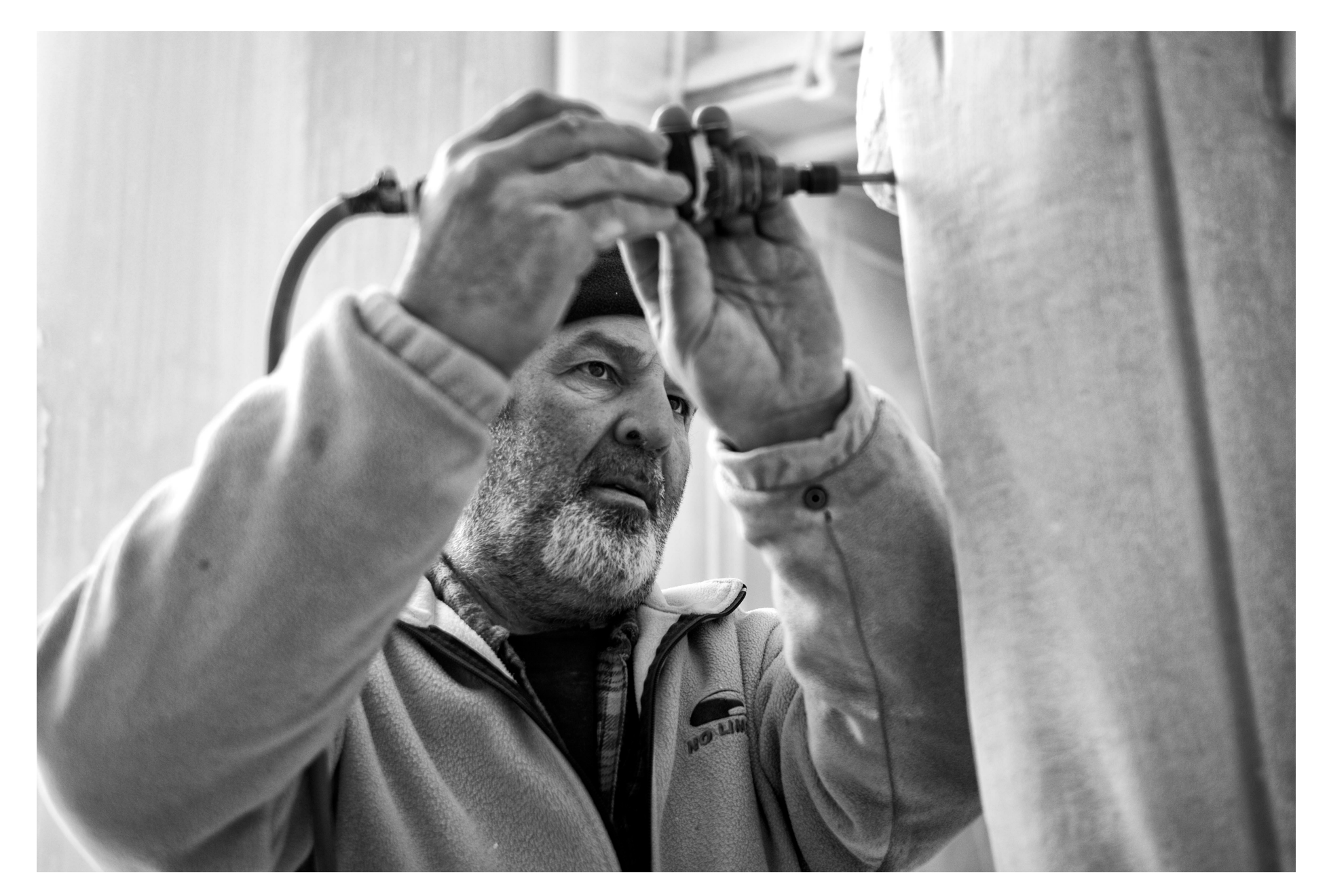
A sculptor while he is working on a marble statue