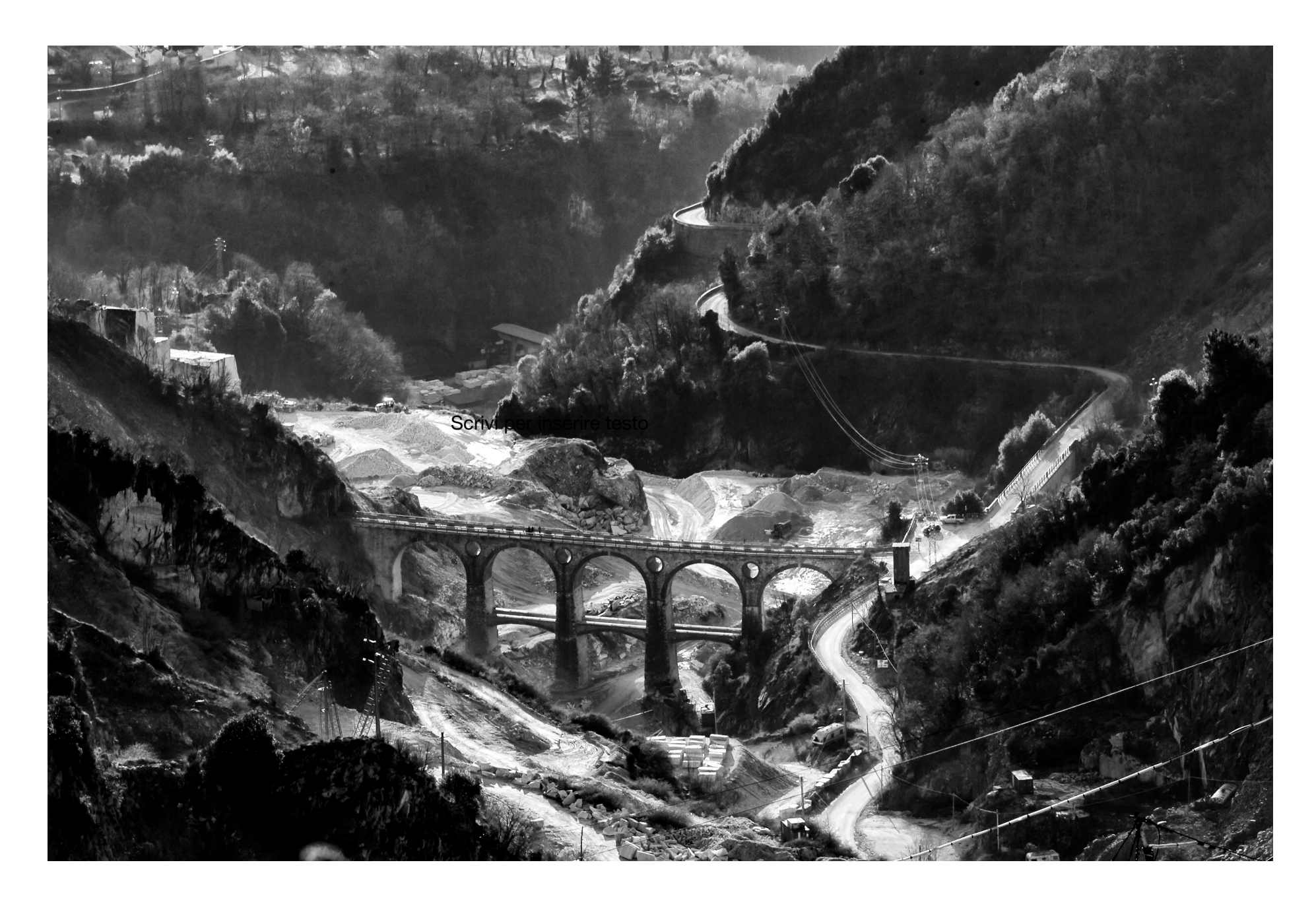
One of the three bridges of vara that were built in 1890 to complete the railway network for the transport of marble from the quarries of Carrara.