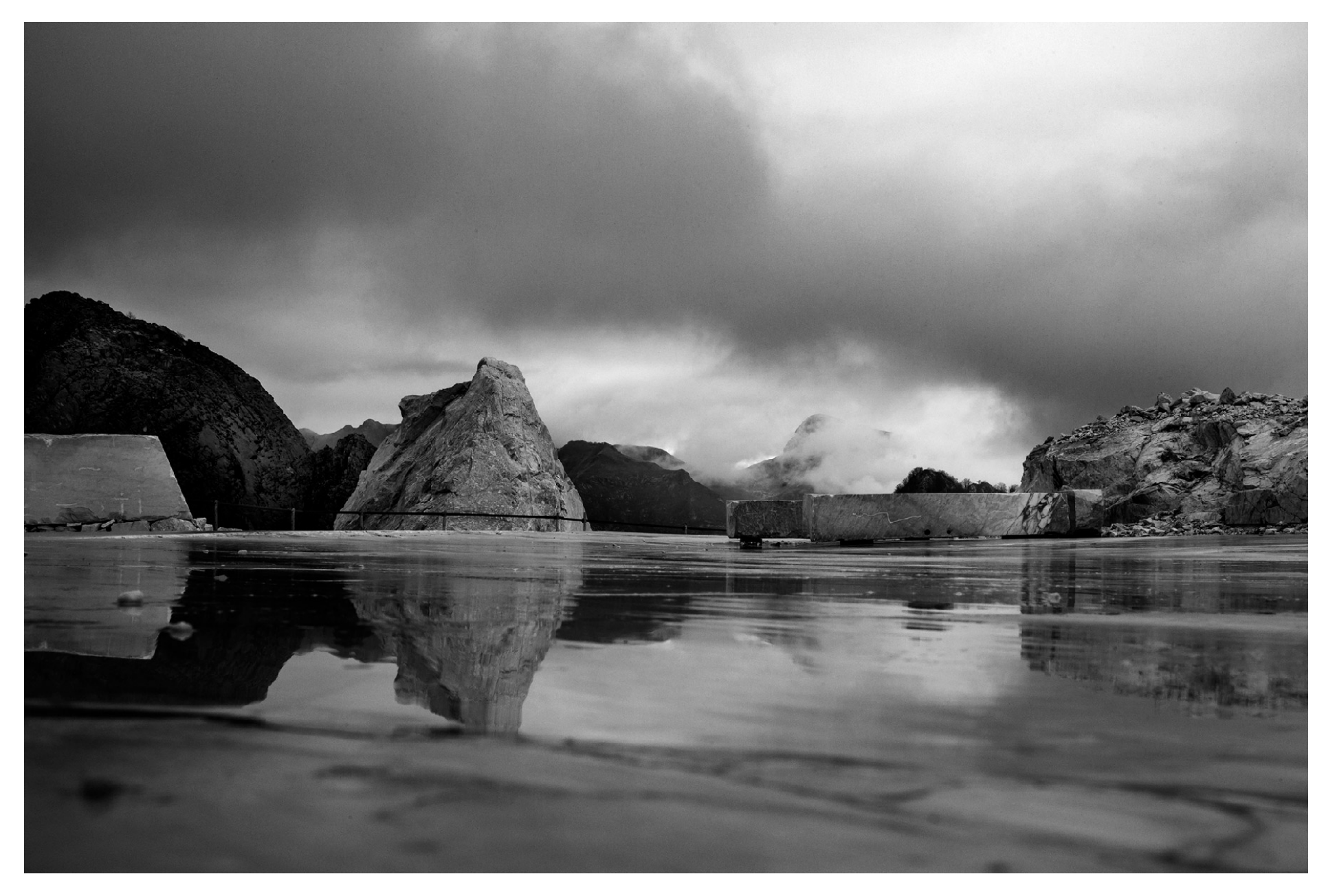
Mount Altissimo, Henroux quarry at an altitude of 1280 meters, one of the highest marble quarries