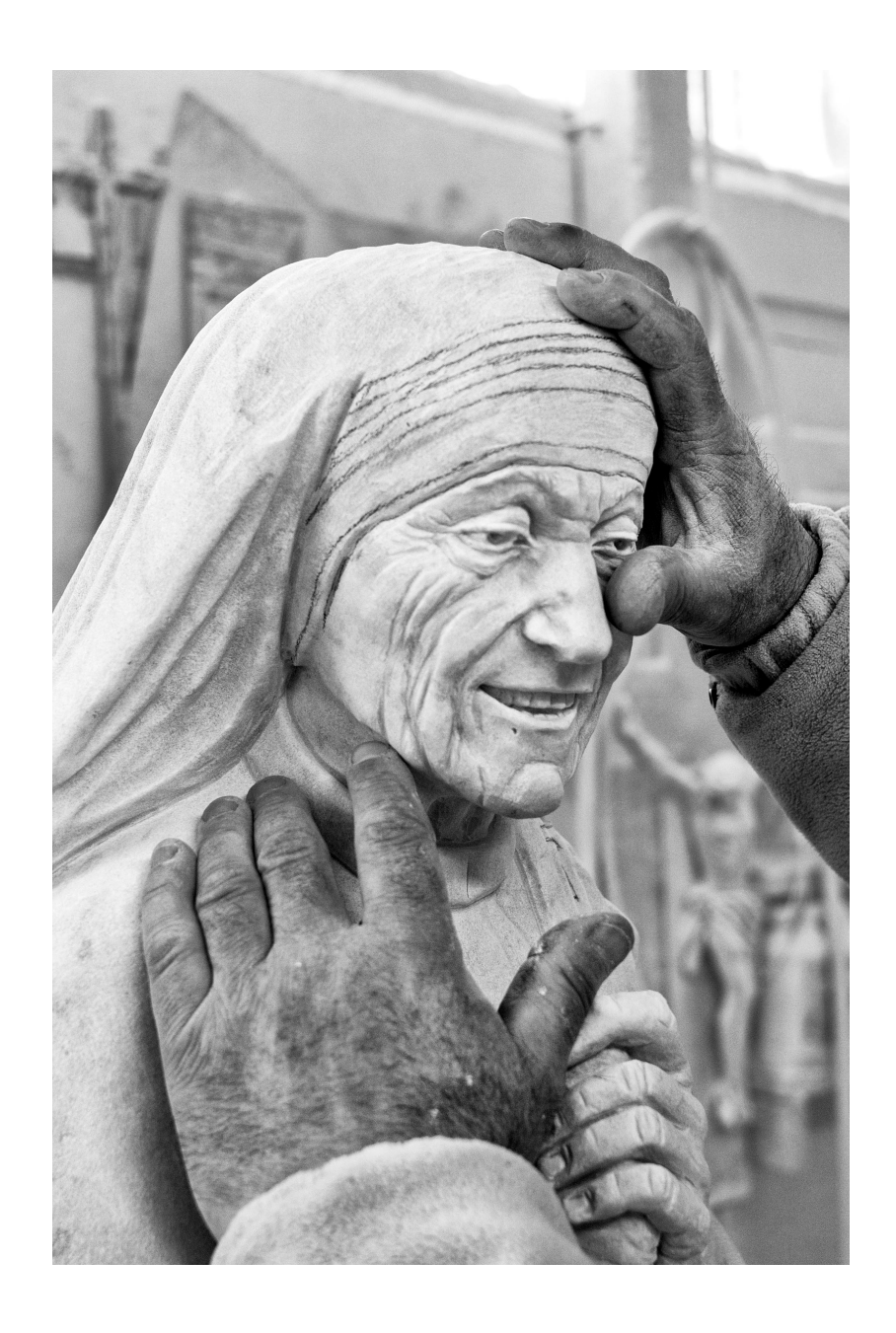
The hands of a sculptor smooth the face of the statue of Mother Teresa of Calcutta that is taking shape