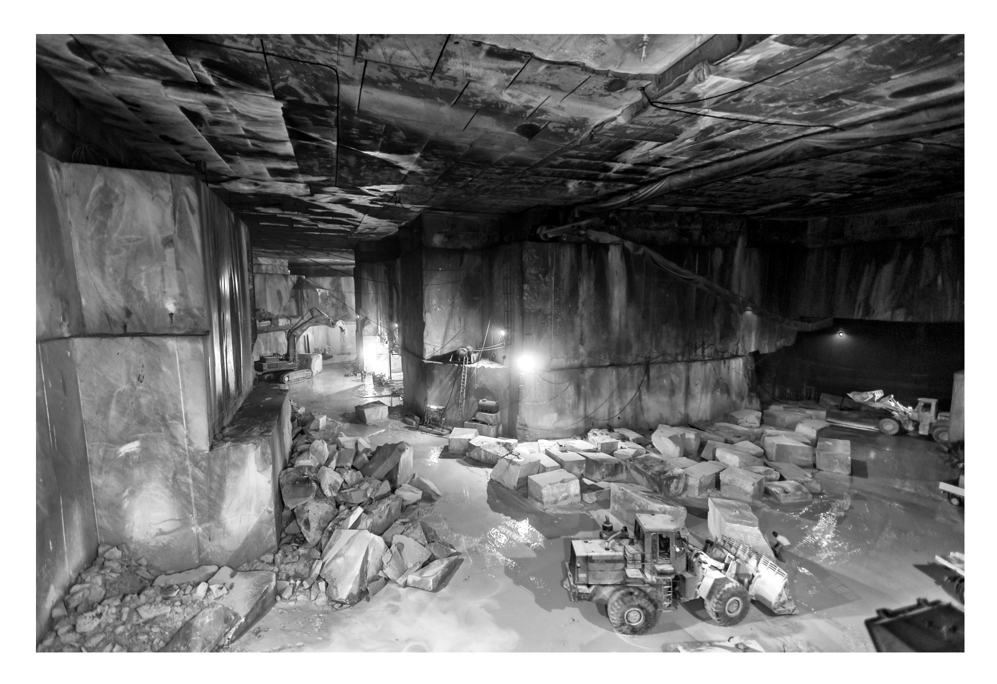
Quarry in the cave of the mountain at Fantiscritti