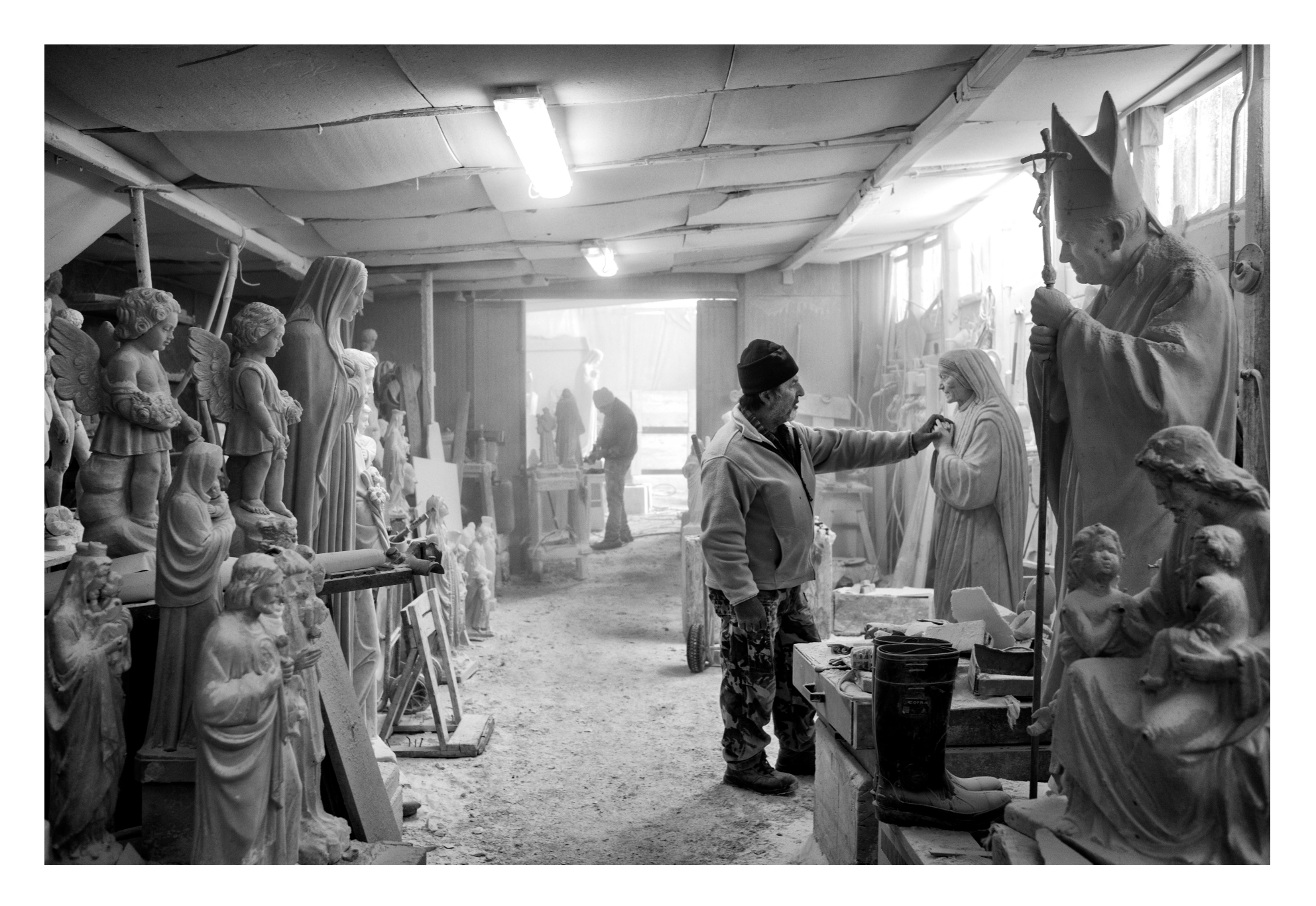
The interior of one of Carrara's oldest marble sculpture workshops