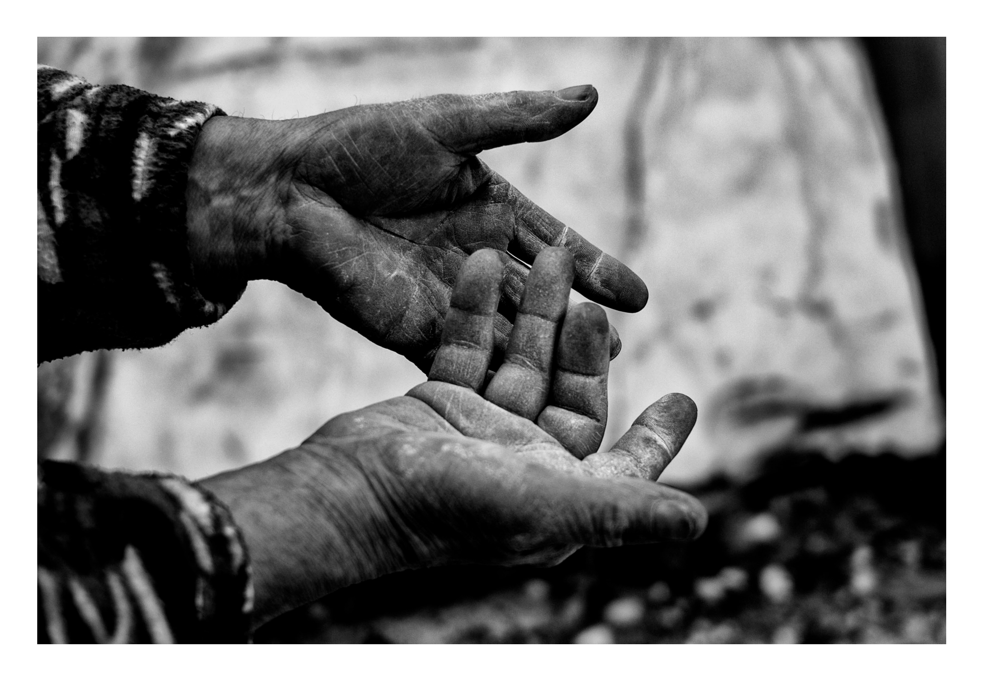
The hands of a marble sculptor marked by time and work